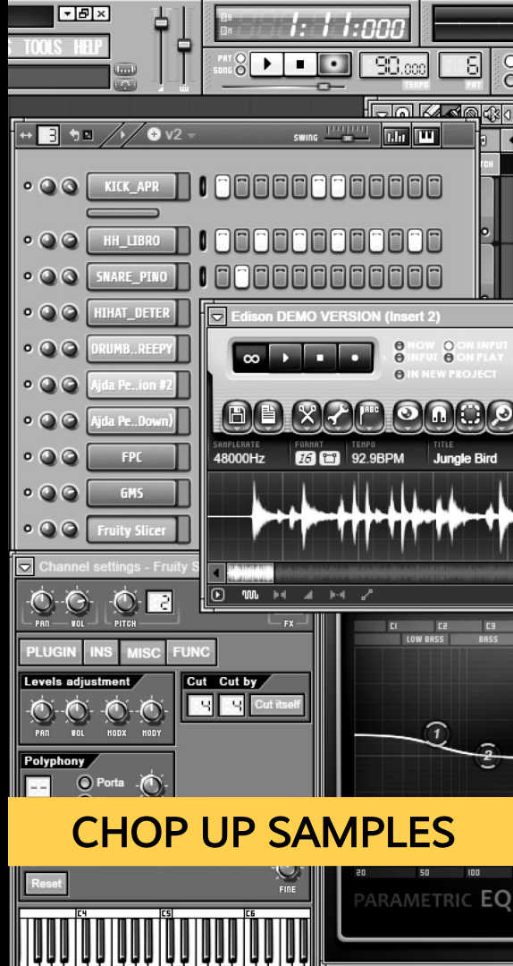
CHOP UP SAMPLES